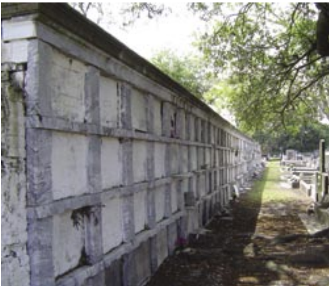
Fig. 1: A large mausoleum within St. Louis Cemetery No. 1 in New Orleans. Mausoleums are typically constructed for use by individual families and for members of organizations, such as the Grange

This article had initially been scheduled for the October 2005 issue, just prior to the ACI Fall 2005 Convention that was to take place in New Orleans, LA. In the wake of the destruction caused by Hurricane Katrina and the subsequent relocation of the convention, the article was postponed. It is presented now in tribute to the historic legacy of New Orleans as the city's reconstruction continues.