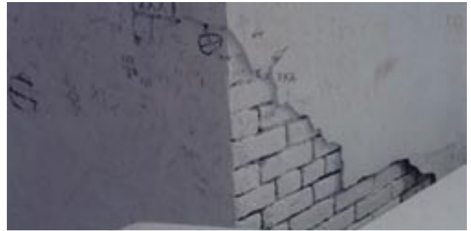
Fig. 5: This crypt also shows the stucco of lime and cement over the brick structure. Sometime in the 1960s, X marks or cross signs began showing up on crypts as part of supposed voodoo ritual. According to tradition, however, they have no connection to voodoo practice. Cemetery preservationists consider the marks acts of vandalism