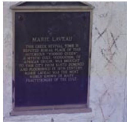
Fig. 6: At the very front of St. Louis Cemetery No. 1 is located one of the most famous crypts, that of Marie Laveau, the Voodoo Queen. The X marks are clearly visible