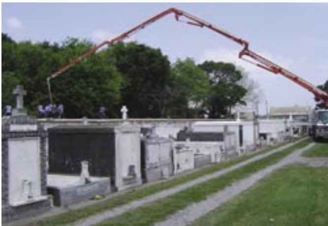
Fig. 3: Another view of a “city of the dead” within a New Orleans cemetery. A concrete pump is being used for the repair of a cemetery wall