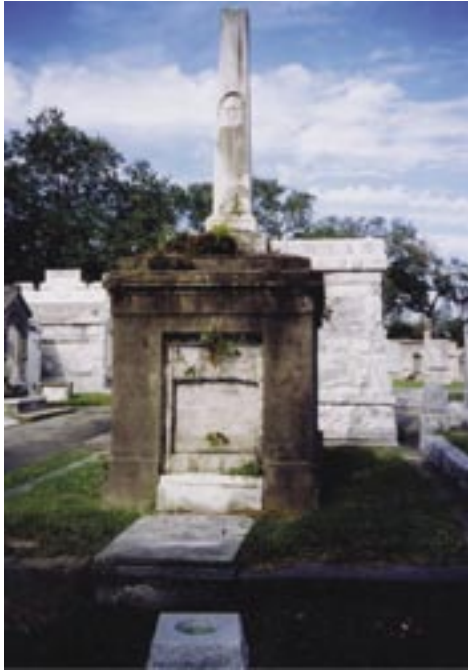
Fig. 2: A typical New Orleans cemetery resembles a small city—a “city of the dead”