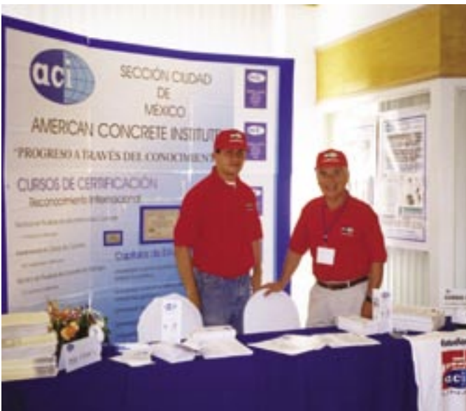
ACI certification training is conducted in Spanish throughout Latin America

Many committee members employed technicians who were highly skilled and capable of performing nondestructive tests, mixture adjustments, reinforcement and forms inspections, and other concrete testing and inspection work. But many also had technicians just starting their careers, who knew very little about concrete and had no formal education in concrete technology. The question really centered on at what level ACI should certify: