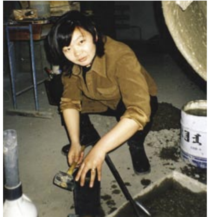
Students as far away as Mongolia have also benefited from ACI certification training

Training programs are now available from a variety of sources such as colleges/universities (some civil engineering programs require the ACI FTT Certification exam as part of their materials courses), highway departments, testing laboratories, materials suppliers, trade associations, ACI chapters, unions, and governmental agencies. Most ACI Local Sponsoring Groups