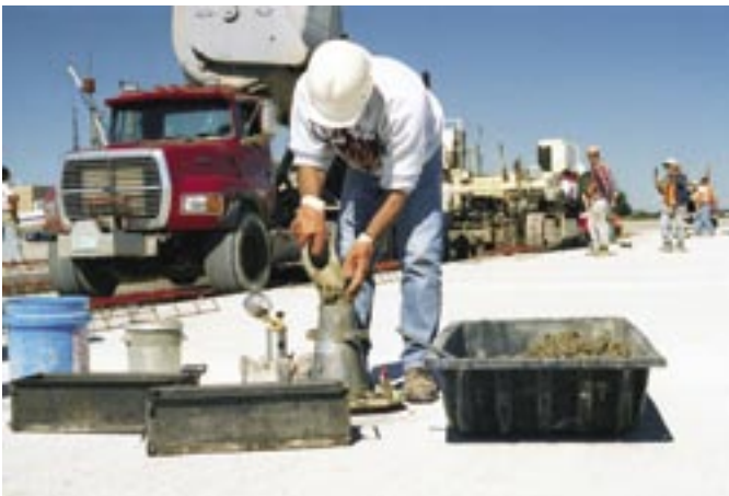
Individuals certified as Concrete Field Testing Technician—Grade I have demonstrated the knowledge and ability to perform and record the results of basic field tests on freshly mixed concrete, including slump flow testing