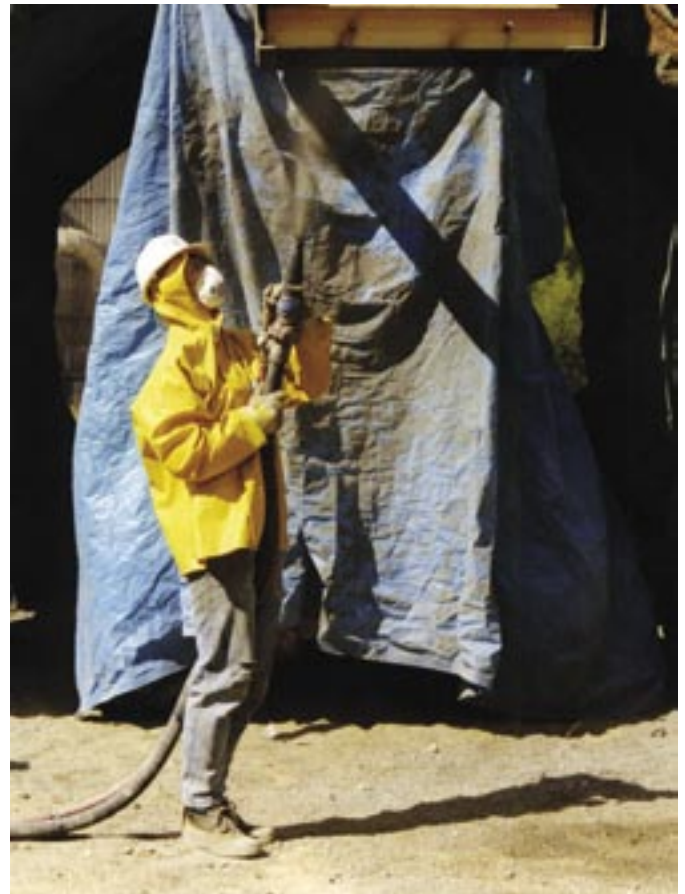
An ACI Shotcrete Nozzelman certification exam in progress